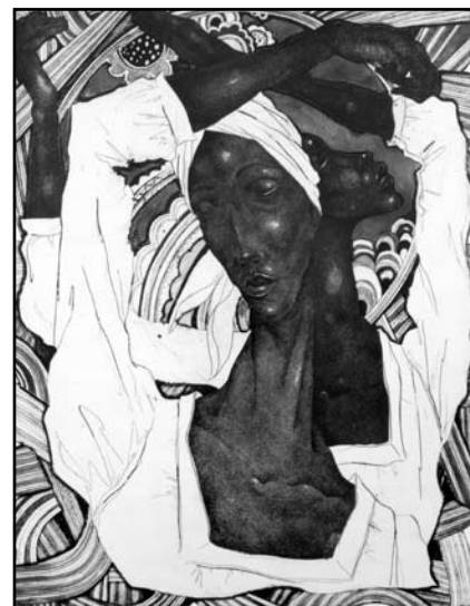
Eldzier Cortor Dance Composition No. 31 , 1978, Color intaglio on paper Courtesy of Kenkeleba Gallery, © Eldzier Cortor In “Black Spirit”: Works on Paper by Eldzier Cortor Spring, 2006 Indiana University Art Museum – Bloomington, Indiana