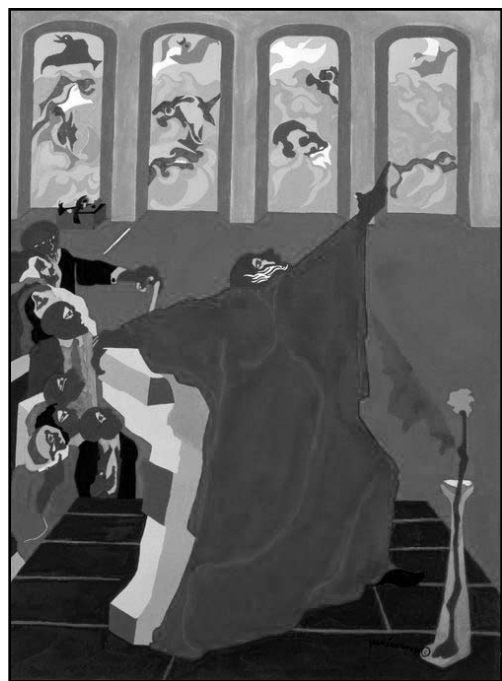
Jacob Lawrence, Genesis Creation Sermon V , 1989, Gouache on paper.

University of Iowa Museum of Art – Iowa City, Iowa