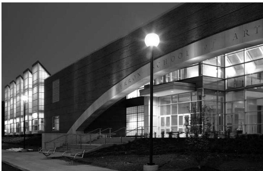
Eskenazi Hall, Herron School of Art and Design, Indianapolis, Indiana

Registration forms and travel and lodging information are available in the back pages of this newsletter and online at the MAHS website. Proposals for papers are due by December 15 to the session chairs. The call for papers is included in this newsletter and is also available online. To receive the early bird rate for conference registration, please register by February 23.