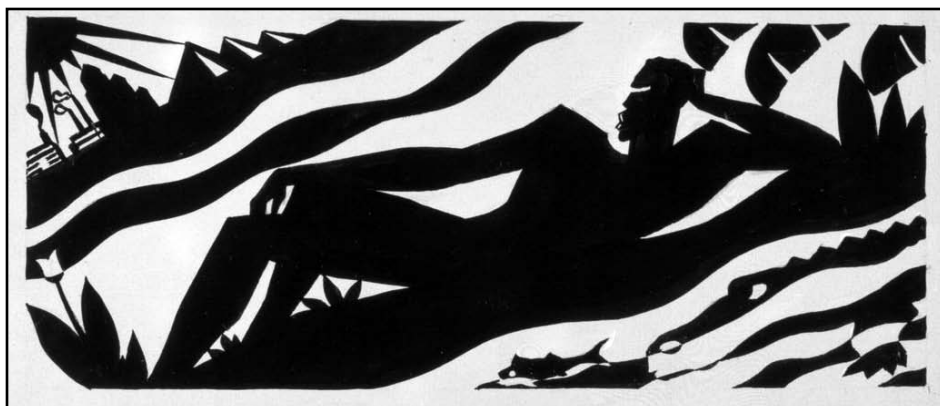
Aaron Douglas The Negro Speaks of Rivers (for Langston Hughes) , 1941 Pen and ink on paper Walter O. Evans Collection In African American Art from the Walter O. Evans Collection , Spring/Summer, 2006 The Detroit Institute of Arts