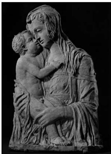
Attributed to Donatello

Minneapolis Institute of Arts – Minneapolis, Minnesota