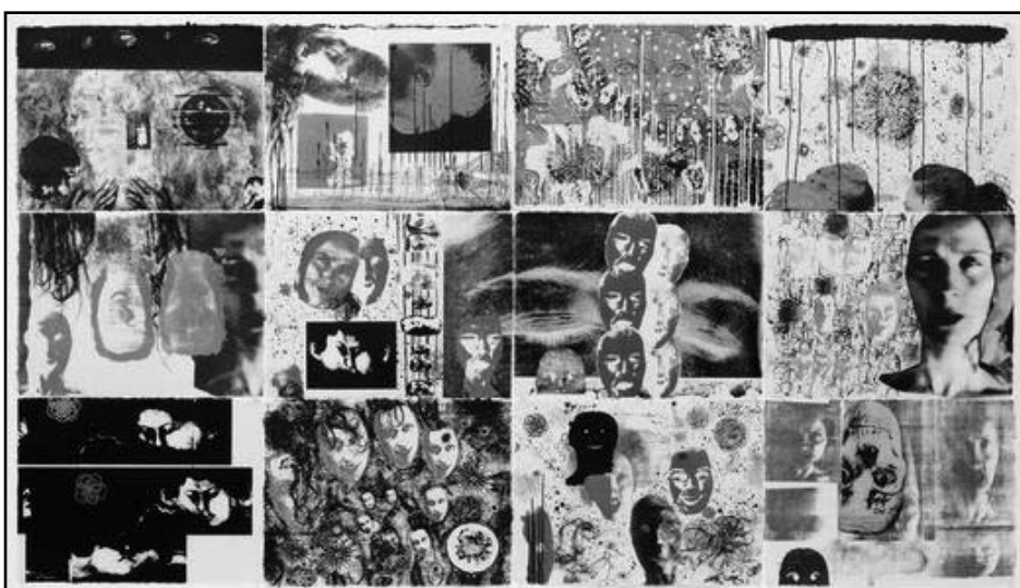
Kiki Smith, Banshee Pearls , 1991