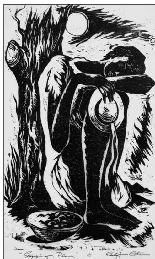
Eldzier Cortor Stopping Place , ca. 1950 Woodcut on paper Courtesy of Kenkeleba Gallery © Eldzier Cortor In “Black Spirit”: Works on Paper by Eldzier Cortor Spring, 2006 Indiana University Art Museum – Bloomington, Indiana