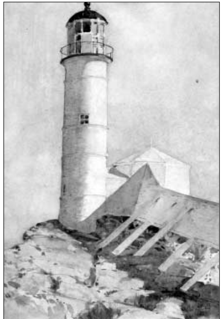
Childe Hassam, New Hampshire Lighthouse, White Island , 1886 Watercolor