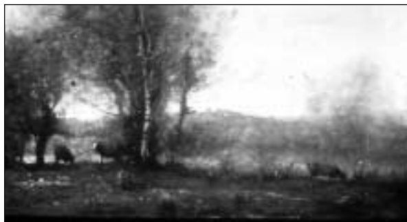
Jean-Baptiste Camille Corot, Three Cows at the Pond ( Souvenir Ville d'Avray , c. 1855-1860, Oil on canvas)