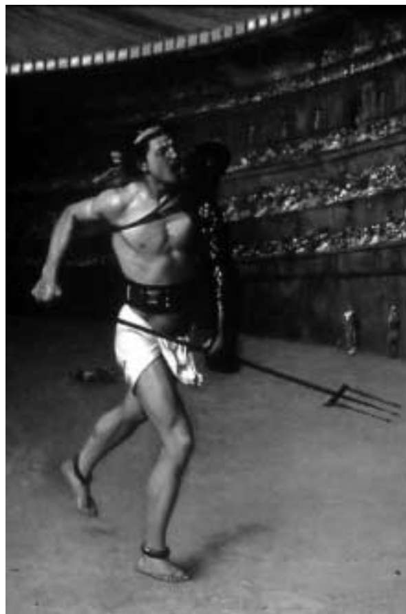
Jean Leon Gerome Retarius , c. 1870, Oil on panel