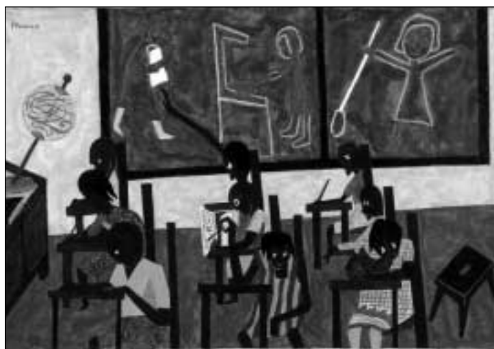
Jacob Lawrence, School Room, Harlem Series, No. 8 , 1943