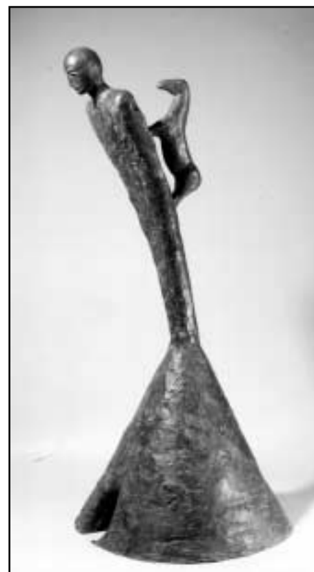
Mimmo Paladino Tana , 1993, Bronze