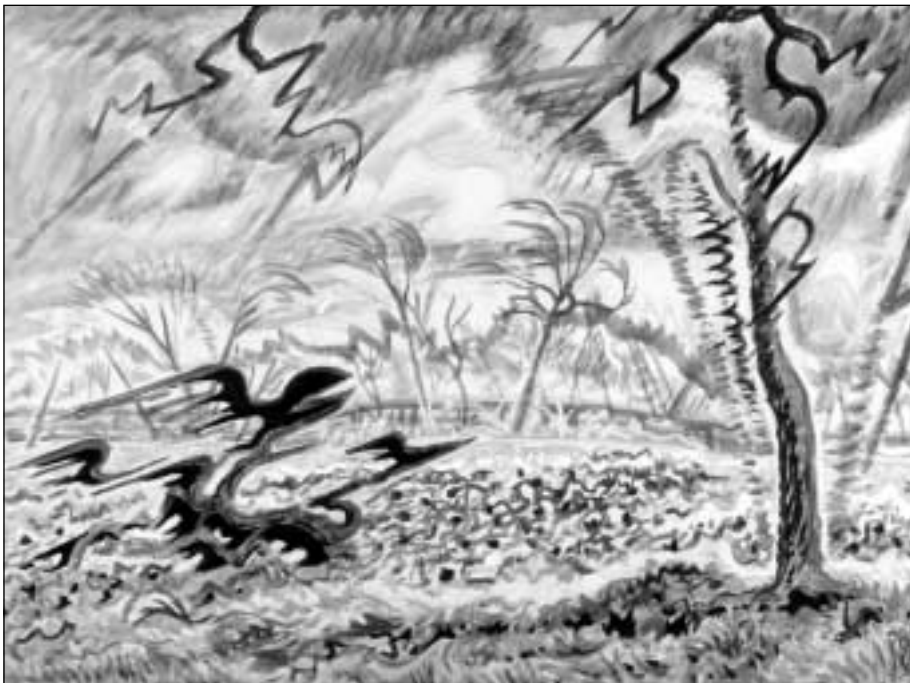
Charles Ephraim Burchfield Stormy Day in March , 1917-1955 Graphite, oil, and watercolor on paper laid down to panel