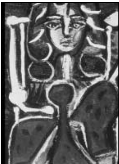
Pablo Picasso, Young Girl on a Sofa , 1949 Oil on canvas

On view in Modern Masters: Corot to Kandinsky through June 29, 2003