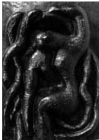
Henri Laurens Night , 1937, cast 1950 Bronze

Recent acquisitions of the Frederik Meijer Gardens and Sculpture Park, Grand Rapids, Michigan