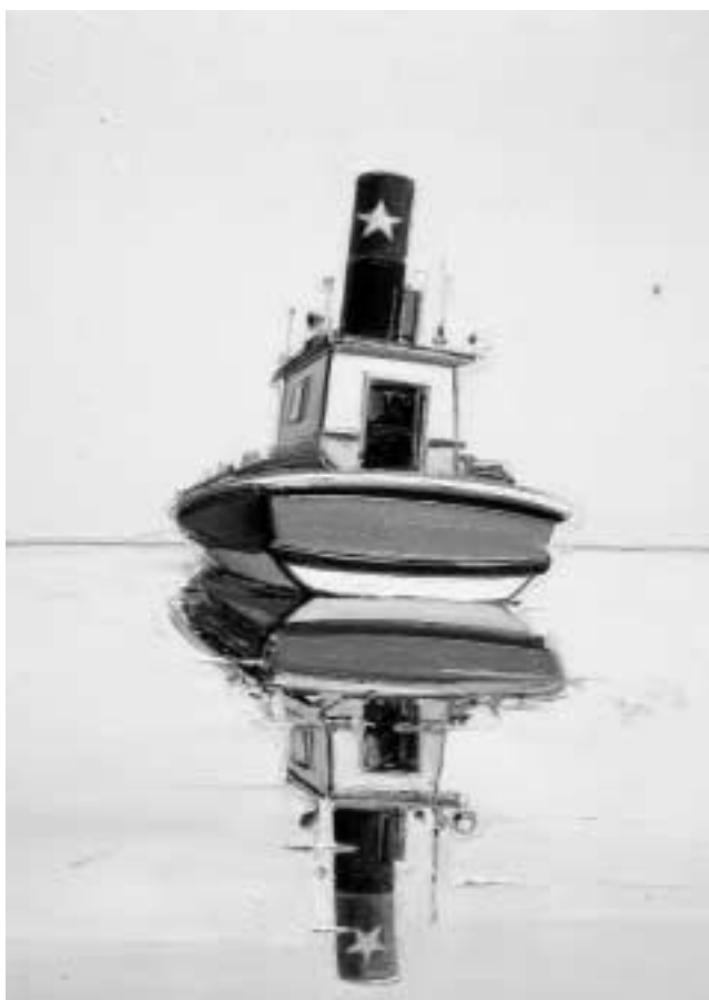
Starboat (Tugboat and Riverboat) , 1966, Oil on canvas