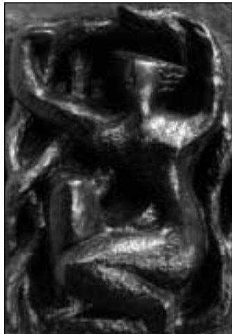
Henri Laurens Day , 1937, cast 1950 Bronze

On view in Angela White: Garbology , through May 4, 2003 Museum of Contemporary Art – Cleveland, Ohio