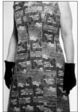
Angela White Café Westend Postcard Dress , 2001 Mixed media

On view in Angela White: Garbology , through May 4, 2003 Museum of Contemporary Art – Cleveland, Ohio