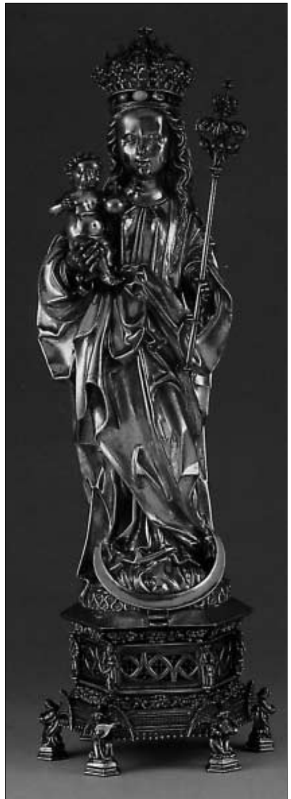
South German Virgin and Child , 1486 Silver, parcel-gilt, stones (opal, clear and pale sapphires, garnets, and pale emeralds)

Recent acquisition of the Frederik Meijer Gardens and Sculpture Park—Grand Rapids, Michigan