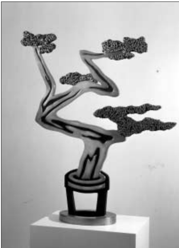
Roy Lichtenstein, Bonzai Tree , 1993 Pewter and patinated bronze

Recent acquisition of the Frederik Meijer Gardens and Sculpture Park—Grand Rapids, Michigan