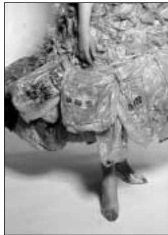
Angela White Plastic Bag Dress , 2001 (detail) Mixed media

Philbrook Museum of Art – Tulsa, Oklahoma