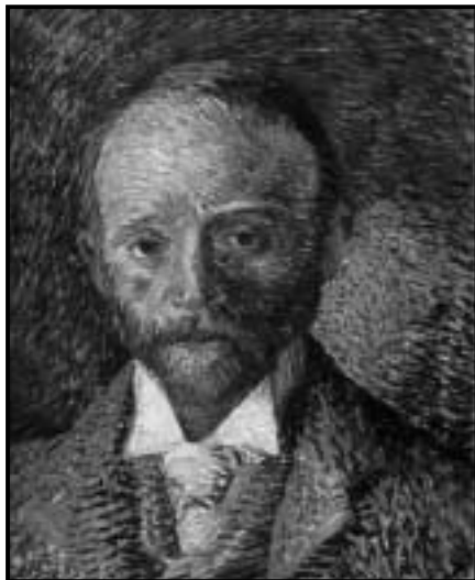
Vincent Van Gogh Portrait of Alexander Reid , 1887 Oil on board

On view in Millet to Matisse: Nineteenth- and Twentieth-Century French Painting from Kelvingrove Art Gallery, Glasgow, Scotland , through February 2, 2003