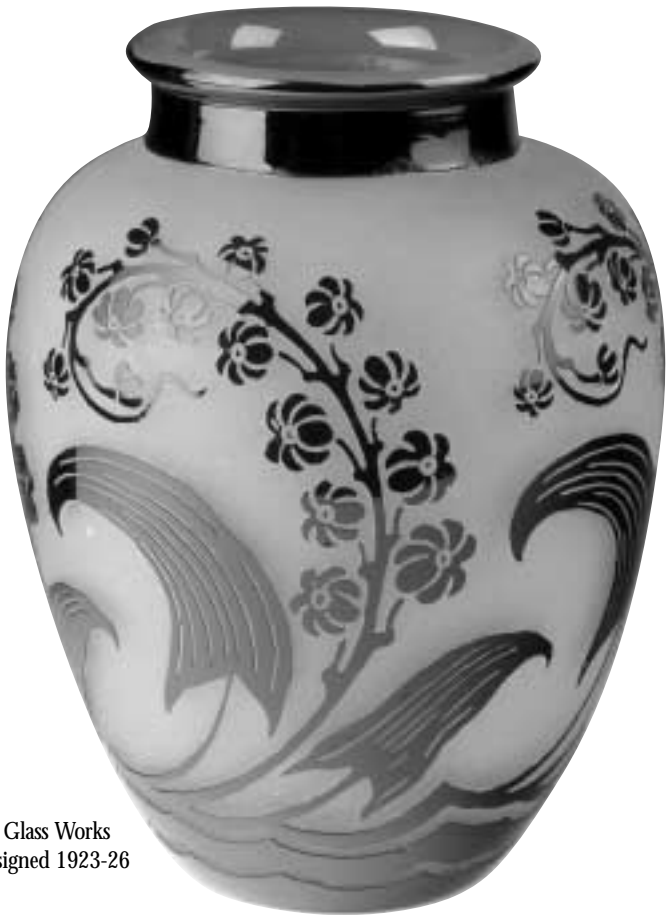
Steuben Glass Works Vase , designed 1923-26 Glass