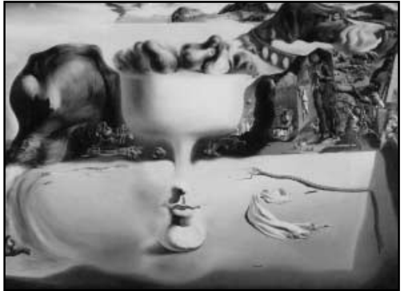
Salvador Dali, Appartition of Face and Fruit Dish on a Beach, 1938, oil on canvas, Wadsworth Atheneum Museum of Art, Harford, Ella Gallup Sumner and Mary Catlin Sumner Collection.

On View in Caravaggio to Dali , June 27 through September 26, 2004