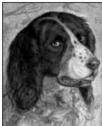
Hendrick Goltzius Goltzius's Dog , c. 1595-1600 Black, brown, red and yellow chalk, brush in brown and black ink (the eyes touched in with a brush and black body color)