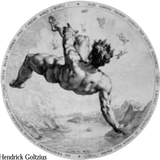
Hendrick Goltzius Phaeton (from the series The Four Disgracers ), 1588 Engraving

The Metropolitan Museum of Art, New York