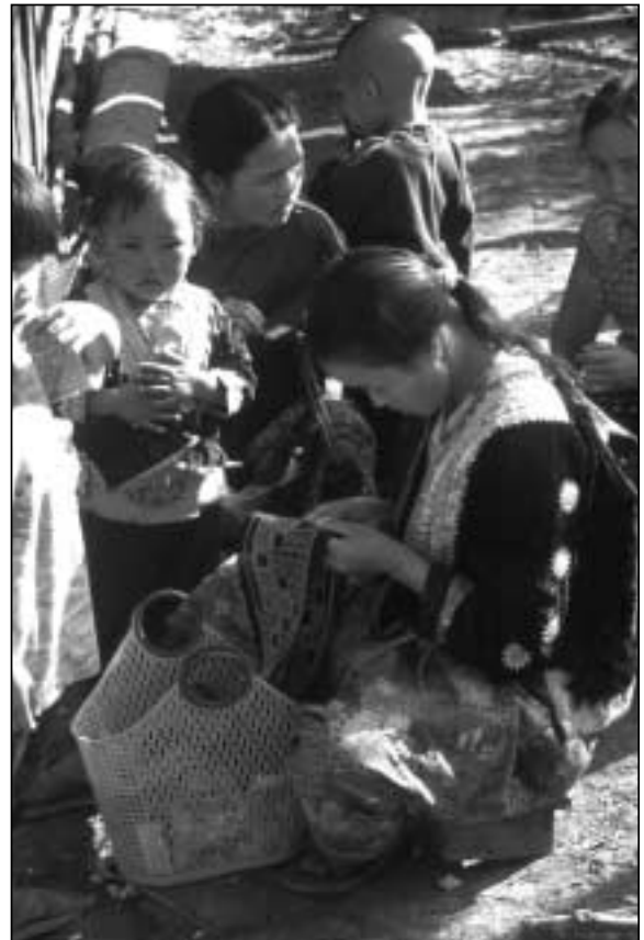
Among girl at her embroidery