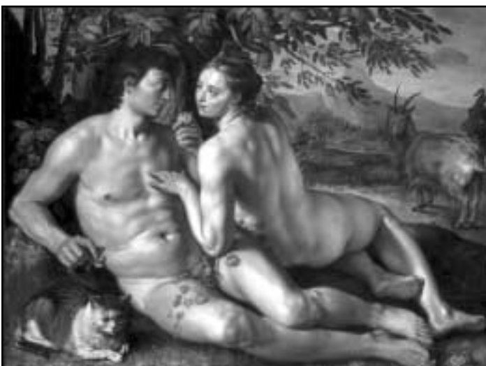
Hendrick Goltzius The Fall of Man (detail), 1616 Oil on canvas

National Gallery of Art, Washington, D.C . On view in Hendrick Goltzius, Dutch Master (1558-1617): Drawings, Prints, and Paintings , through January 4, 2004