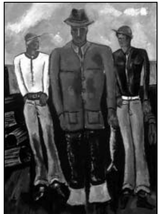
Marsden Hartley, Down East Young Blades , c. 1940 Oil on Masonite-type hardboard

Wadsworth Atheneum Museum of Art, Hartford, Connecticut