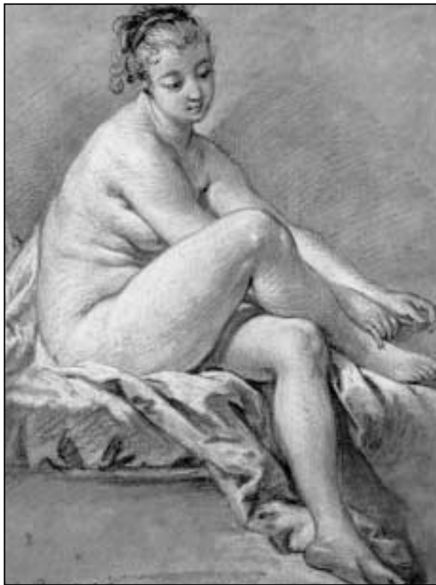
Francois Boucher Study of a Seated Young Female Nude Extending Her hands to her Right Foot , c. 1755 Red, black, and white chalks, with graphite and touches of blue chalk, on buff paper.

Berger Collection at the Denver Art Museum